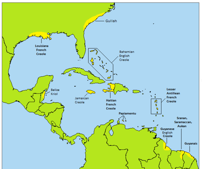
Map: Atlantic Creole languages

Thus Gullah is in a class with other languages that arose in similar circumstances, called creole languages. There are a number of English, French and other creole languages that developed especially, but not exclusively, in the Atlantic part of the New World, as seen in the following map.